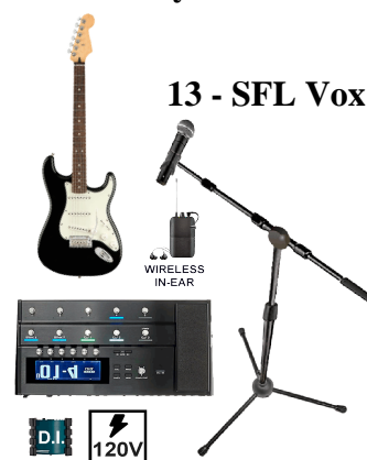
13 - SFL Vox

Stage Left Guitar: Typically plays rhythm