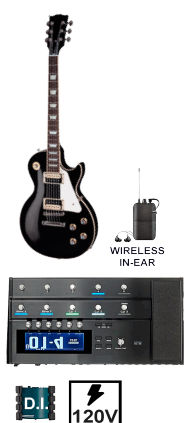
11 - Lead Gtr SR

Stage Right Guitar: Typically plays leads