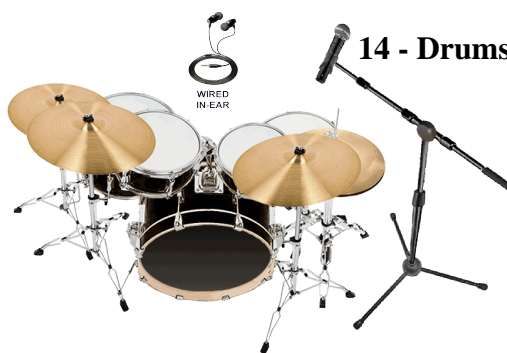
14 - Drums Vox