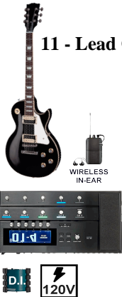
11 - Lead Guitar / Stage Right