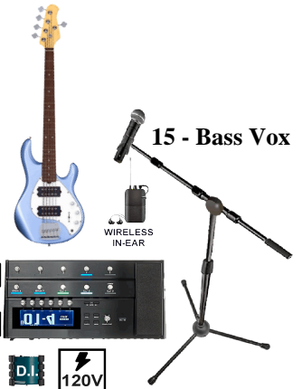
15 - Bass Vox